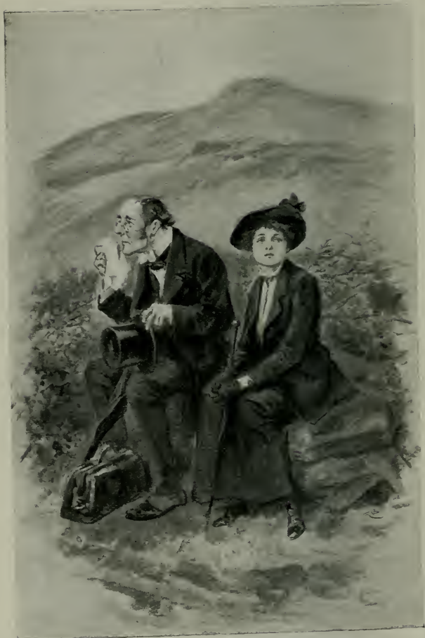
On a lower slope of Bel Tor, with their faces turned to the valley, sat a man and a young girl.